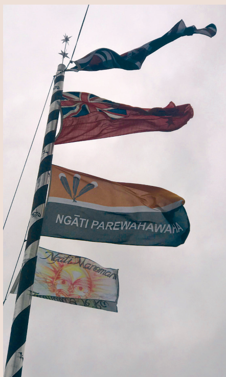
The New Zealand Red Ensign of Ngāti Parewahawaha flies beside the Union Jack of Ngāti Huia at Parewahawaha Marae, along with the flags of Ngāti Parewahawaha and Ngāti Manomano, representing their significant relationships as hapū of Ngāti Raukawa ki te Tonga

The Marine and Coastal Area (Takutai Moana) Act: Following the release in June 2020 of the Tribunal's report on the Crown's processes for customary rights recognition in the coastal and marine area, hearings have commenced in stage 2, which focuses on the Treaty compliance of the Crown's legislation, policies,