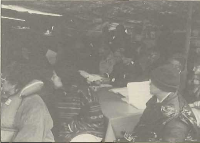
Whanganui site visit 21 April 1994. Hearing evidence at Tieke.

Further iwi evidence as well as Crown and third party evidence is scheduled for hearings in June and July.