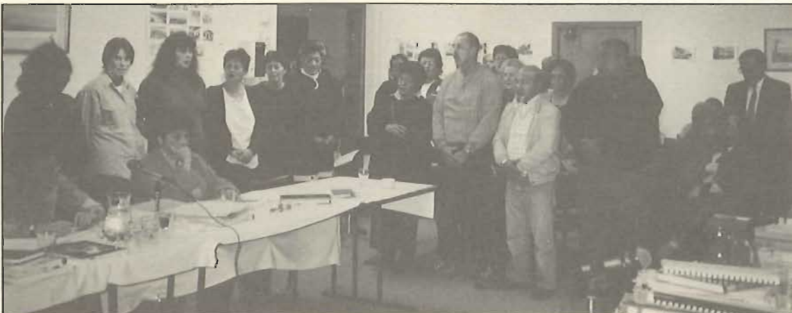
Chathams hearing, Turnbull House, Wellington, 16-10 May 1994.