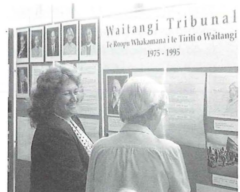
The Tribunal's display attracted a lot of interest.

There were demonstrations of Te Puni Kokiri's Maori language software, the new microfiche project, Nga Whakaaturanga , and the Waitangi Tribunal database. Seminars were held on current claims research, the legal jurisdiction of the Tribunal and the claims process.