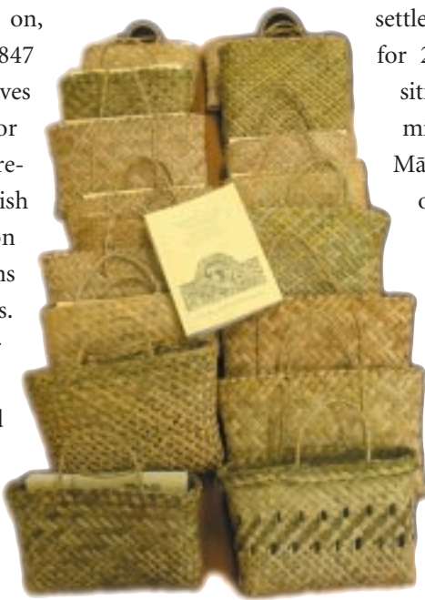
Waitangi Tribunal reports ready for presentation

Treaty breaches accumulated and compounded after the early 1840s and initial settling of title, as the Crown took action to accommodate the growing number of settlers in Wellington City. Māori land was being encroached on, from all sides. In 1847 a series of new reserves were assigned for Māori who were required to relinquish their cultivations on 467 acres of sections claimed by settlers. It was taken for granted that Māori, not settlers, would have to move. All existing cultivations were on good land, chosen for their aspect and location. Māori