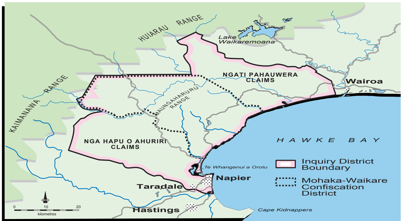
Map: Max Oulton