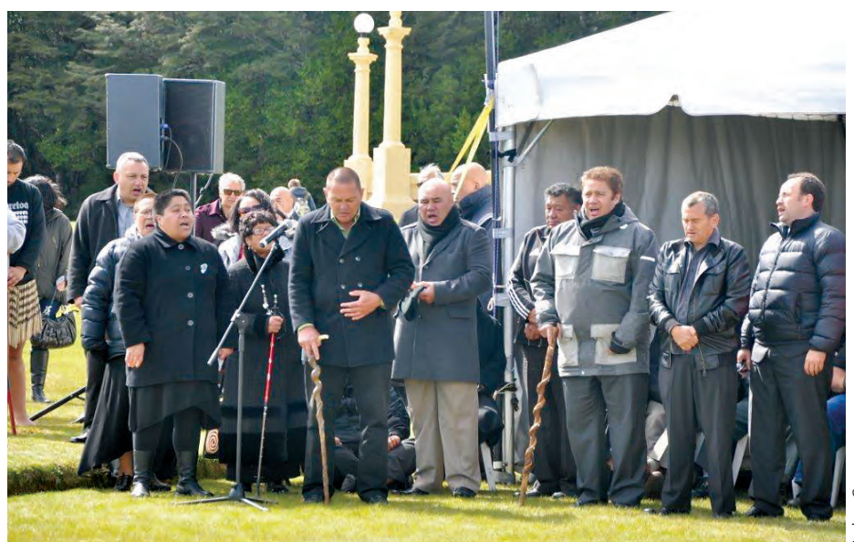
The ceremony at the Chateau Tongariro for the presentation of the Te Kāhui Maunga report