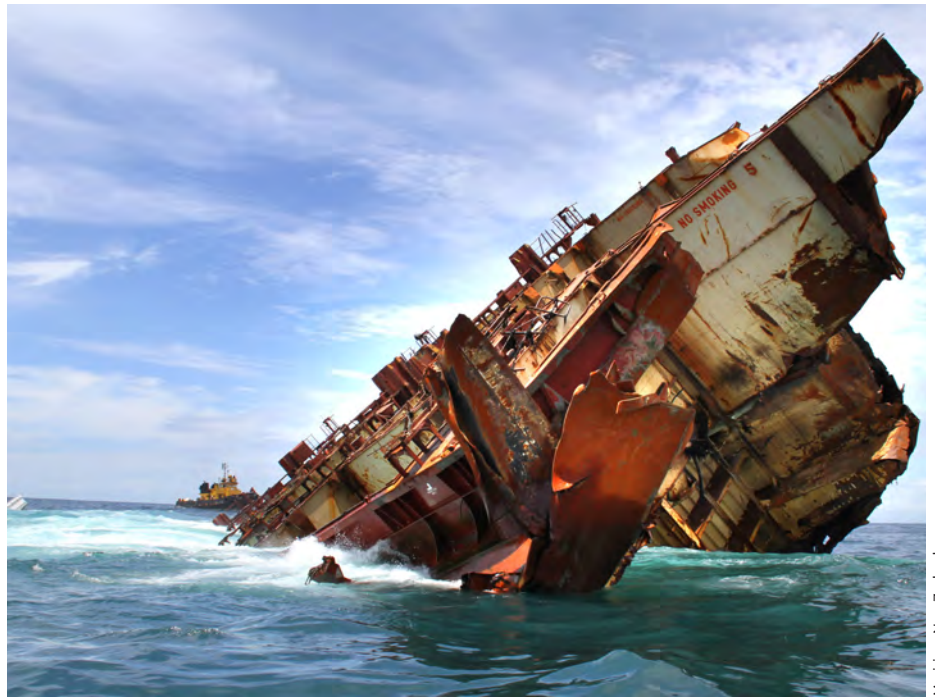
The stern section of the mv Rena almost totally submerged on the Otaiti (Astrolabe) Reef