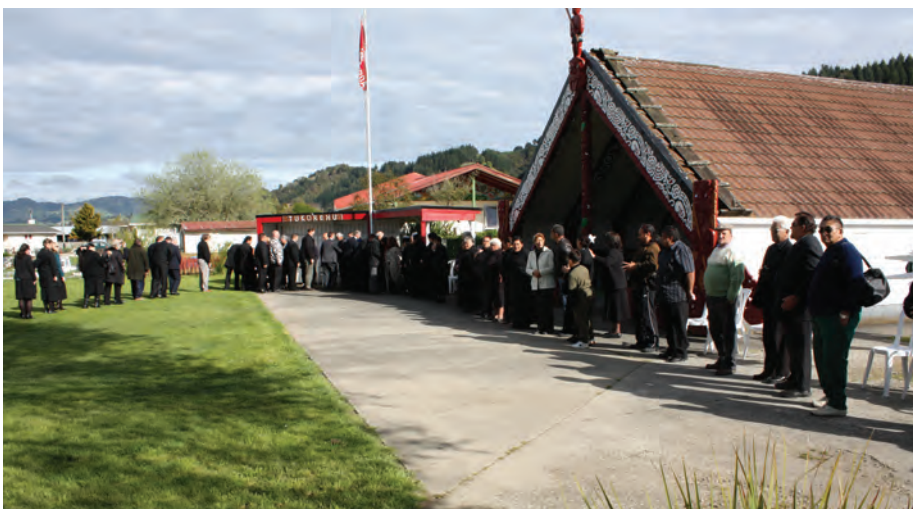
Tangata whenua welcome manuhiri at Wharauora marae, Taumarunui, for a Tribunal hearing in September 2008.

We have called this report He Whiritauonoka: The Whanganui Land Report in the hope that it will mark the beginning of the next stage in the lives of Whanganui Māori, in which they will move beyond conflict with the Crown, and raruraru (difficulties) of their own, to fulfil their aspirations for a future full of harmony, unity, and cultural revival. □