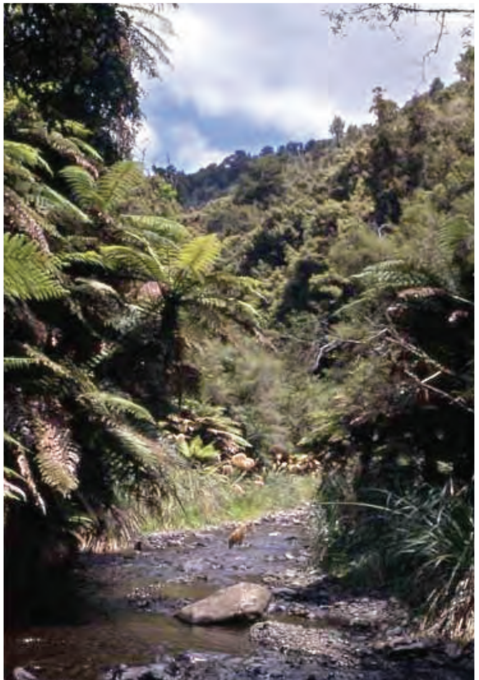
The junction of the Mimiha and Waihou streams, which are tributaries of the Ōhinemataroa (Whakatāne) River, near Ruatāhuna. The river derives its name from the Tūhoe ancestress Hine-mata-roa of Ngā Pōtiki and is a taonga of great significance to Tūhoe.

be sustainable, it remained in breach of Treaty principles at the time of the Tribunal's hearings.