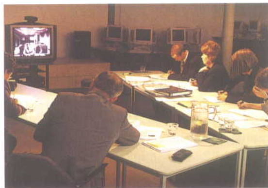
Tribunal Members and Crown representatives listen to evidence via video link at Wai 776 hearing.

audience, usually on a much smaller scale than broadcasting.) The claimants contend that management rights in this frequency band would provide significant benefits for Māori both economically, and in the protection and promotion of Māori language and culture.