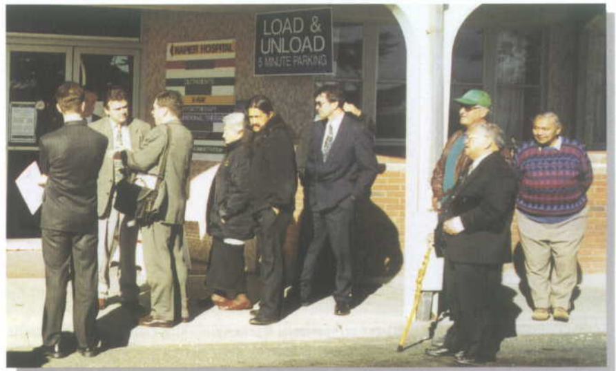
Napier Hospital Services (Wai 692) claimants and counsel get ready for a site visit of the disused parts of the hospital.

The hearing district covers some 800,000 acres of land situated in central-northern Hawkes Bay. The area includes the Mohaka-Waikare raupatu district and two large Crown