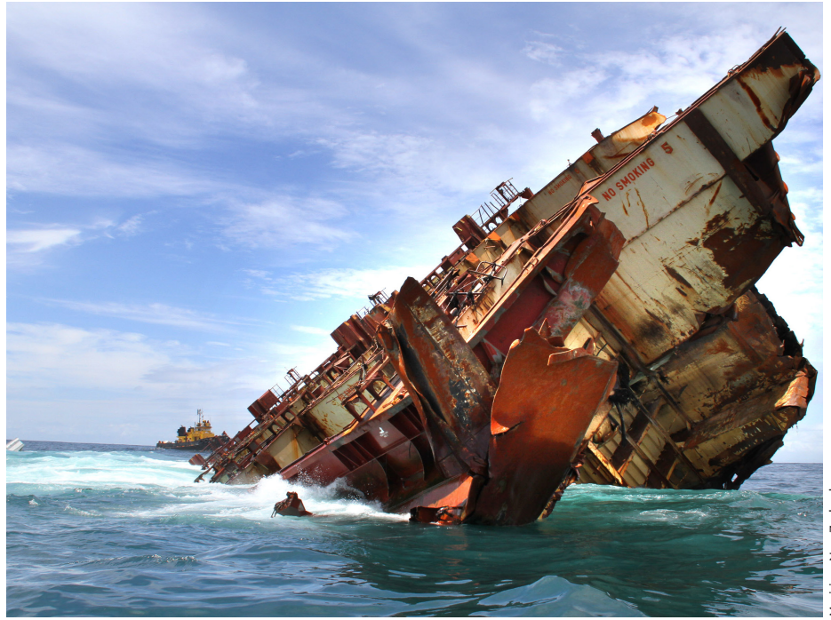
The stern section of the mv Rena almost totally submerged on the Otaiti (Astrolabe) Reef

information on its proposed water management reforms.