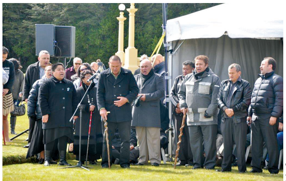
The ceremony at the Chateau Tongariro for the presentation of the Te Kāhui Maunga report