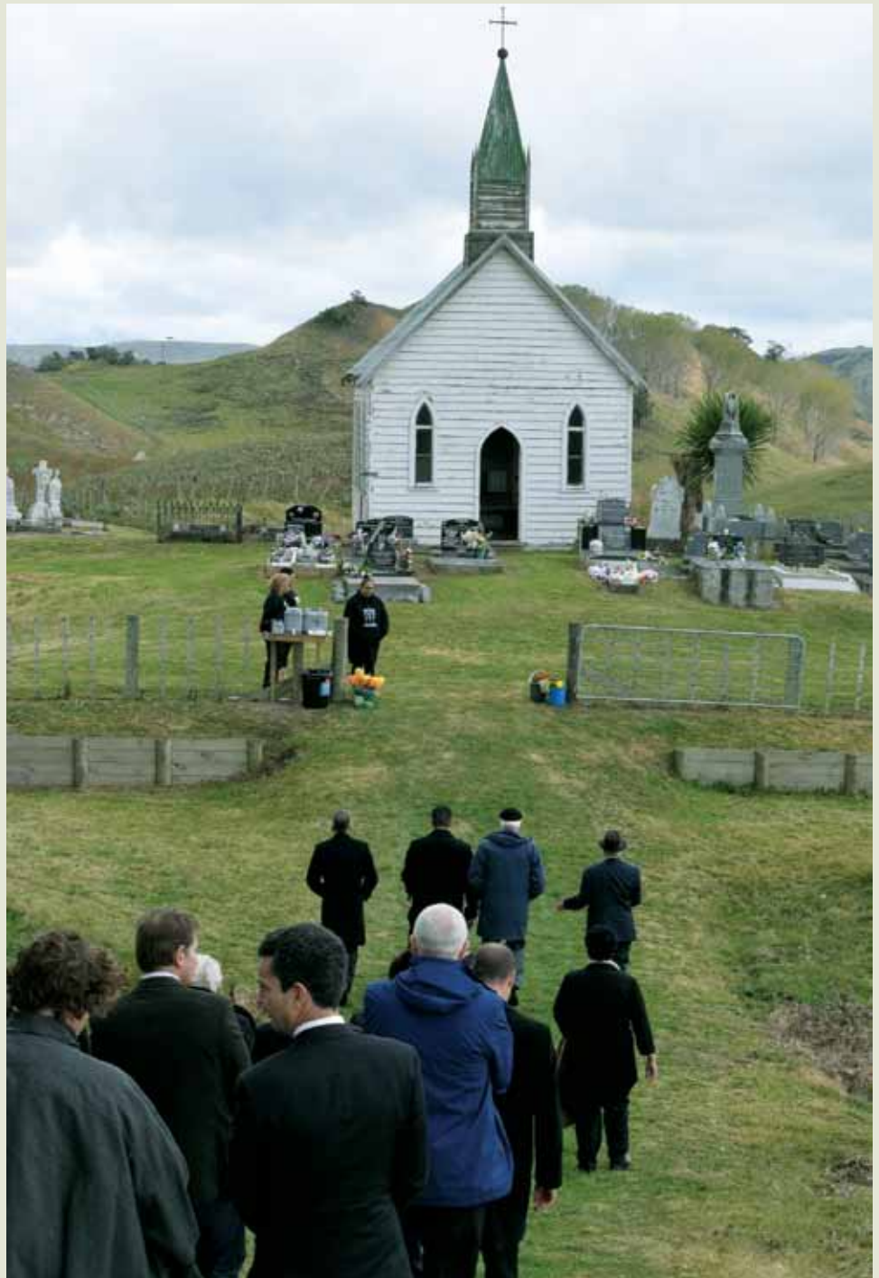
The Taihape Tribunal makes a site visit to Opaea Church and urupā during the sixth hearing week of its inquiry, held in April 2018. Claimant evidence during the week referred to the church and the marae, which are located about eight kilometres north of Taihape.

Te Manutukutuku is produced and published by the Waitangi Tribunal Unit of the Ministry of Justice, and every effort has been made to ensure that it is true and correct at the date of publication.