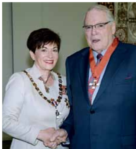
The Honourable Michael Bassett with Governor-General Dame Patsy Reddy