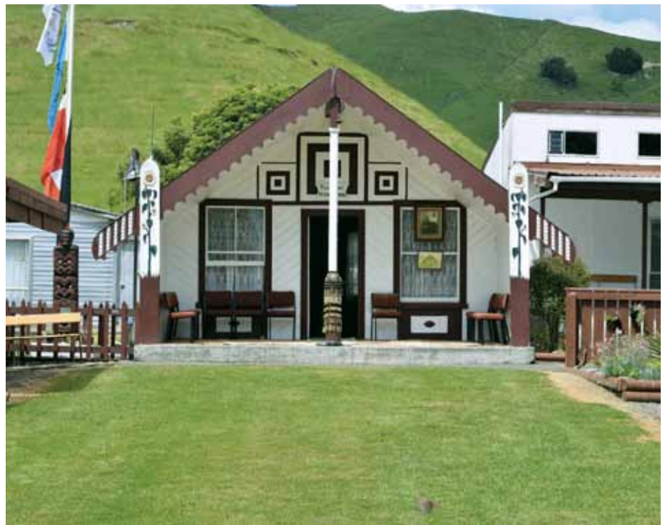
Tautahi, the meeting house erected by Winiata Te Whaaro in 1896 near present-day Taihape

The first stage of the report will focus mainly on the period up to the end of the nineteenth century. It will cover the tribal landscape, the signing of the Treaty in Te Rohe Pōtae, and issues arising from land transactions before 1865. These transactions include 'old land claims' (pre-Treaty transactions) and pre-Native Land Court land purchases by the Crown. Next, the report will deal with the impact of the wars and land confiscations