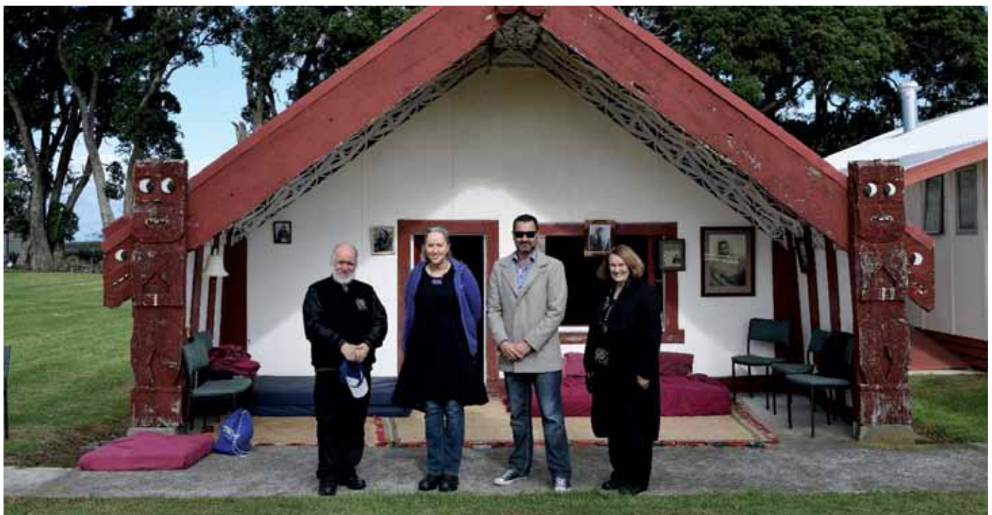
Tribunal members at Tamatea ki te Huatahi Marae during a site visit to Motiti Island

Two further hearing weeks are likely to be scheduled in the Motiti inquiry in the latter half of 2018. □